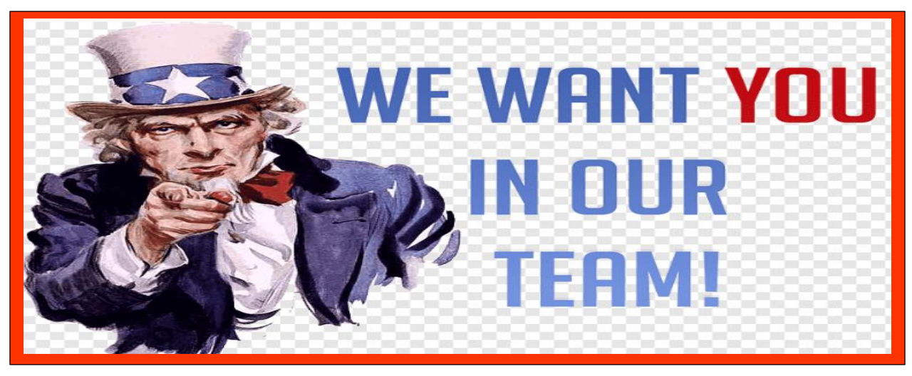
Be Part of Our Newest System