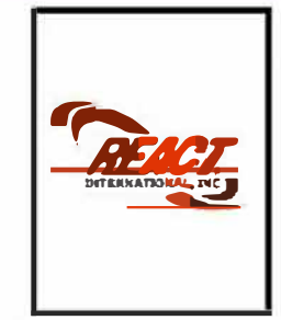
REGION 5 Vacant