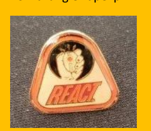
$7.00 Item RC11