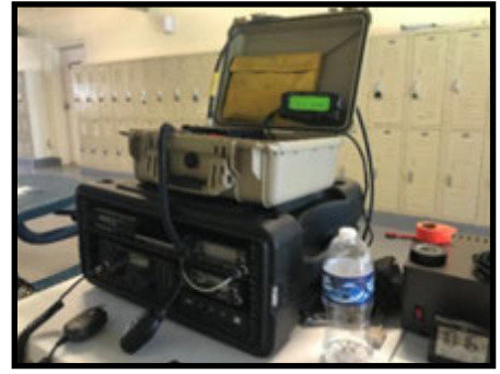
to handle a crowd Alamo Base Radio used in the "Storm Area

Lincoln and Nye County, Nevada declared an emergency due to there being no facilities in the area