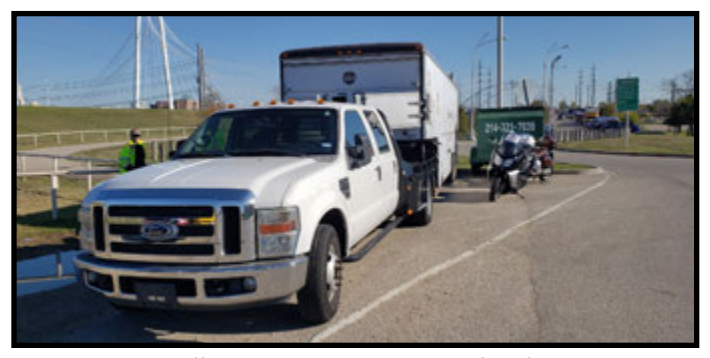
Dallas County REACT Command trailer

Dallas County REACT assembled on Saturday afternoon 11/9 and provided multiple team members for operator shadows of important event staff, and some stationed along the course at aid stations.