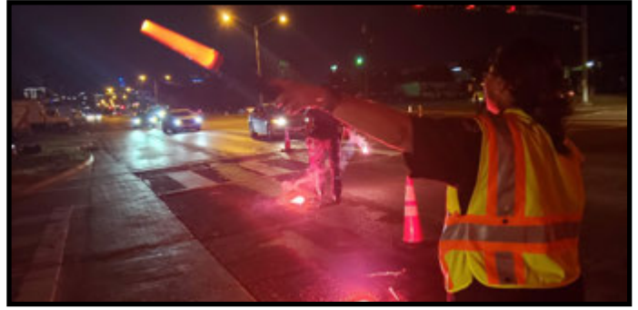
An un-named Dallas Police officer directs traffic at the event

We even had two of our team members on motorcycles patrolling the course. We also worked closely with the Dallas Police and Dallas Fire Rescue to ensure the participants safety throughout the entirety of the event.