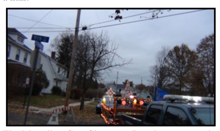
The Massillon City Christmas Parade corresponds with the lighting of the Christmas lights in the City's downtown area.

Alert REACT Response Team assisted with the 65th Annual Massillon City Christmas parade on November 23rd, 2019. We had 5 members in the parade, 3 units on the trailer and 2 in the truck pulling the trailer. The parade lasted around 25 minutes and the Team worked about and hour and a half.