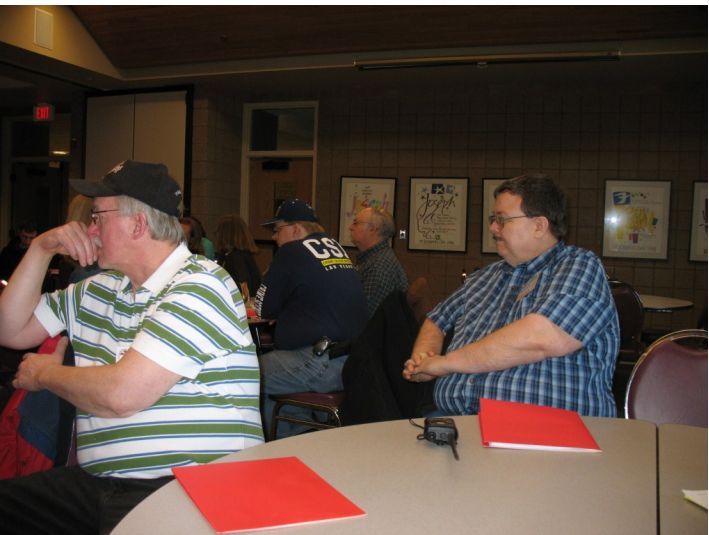
The REACTer / April–June 2010 7