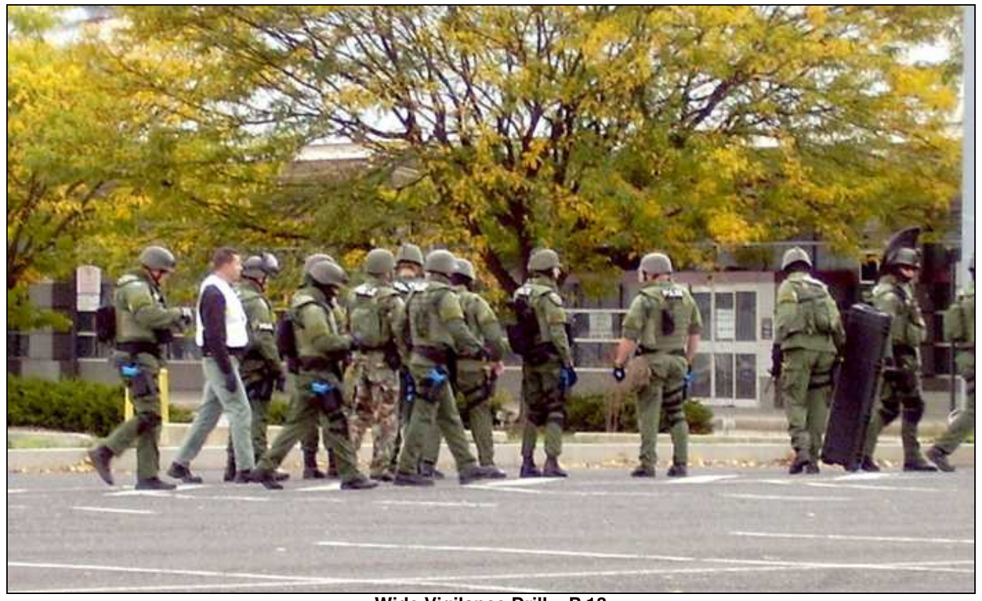
Wide Vigilance Drill - P 13

From the President – 2 From the EVP - 4 Board Minutes – 7 Teams and Team Members – 13 Circulation Statement – 16