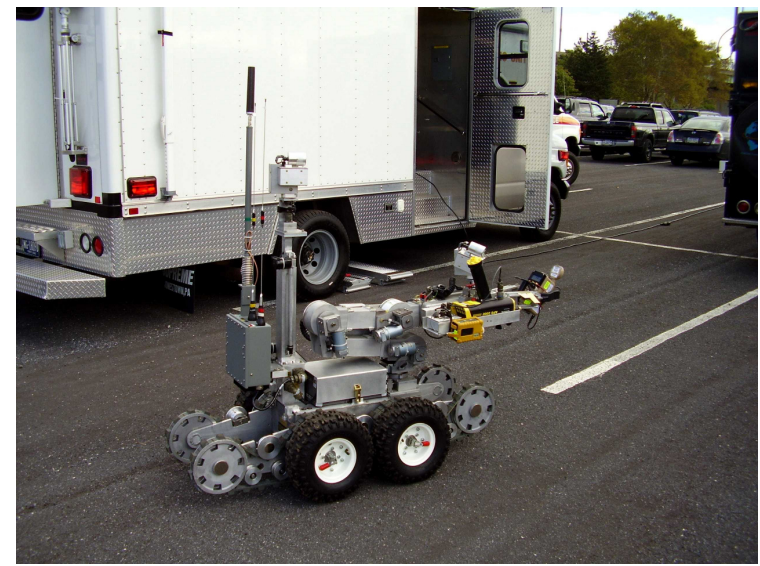
Wide Vigilance Drill - P 13

The REACTer (ISSN 1055-9167) is the official publication of REACT International, Inc., a nonprofit public service corporation. © 2005 RI. All rights reserved. Mailed at Periodicals Rate at Suitland, MD, and other mailing offices. POSTMASTER: